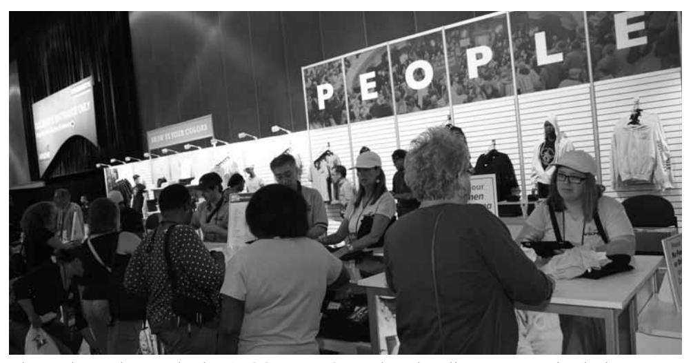
Throughout the week, the AFSCME PEOPLE booth sells union-made clothing, accessories and other gear.

*Credentials Committeee will meet at LACC, directly behind the Registration area in Hall G.