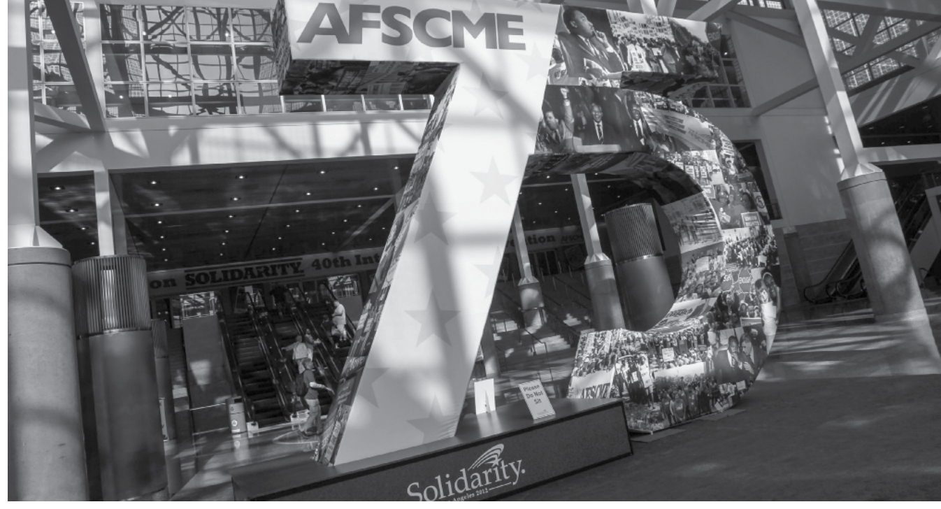
Delegates enter the Los Angeles Convention Center to a reminder that AFSCME is in its 75th year of making America happen.